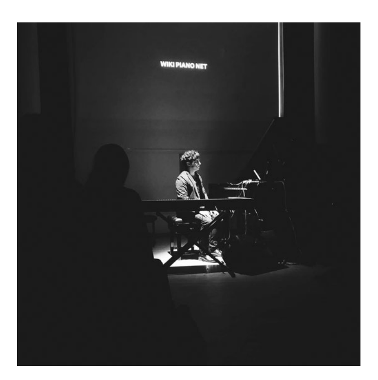
Figure 2: Zubin Kanga performing WIKI-PIANO.NET at Huddersfield Contemporary Music Festival.

WA State Theatre, Perth (Australia, 24 April 2019) Queensland Conservatorium of Music, Brisbane (Australia, 26 April 2019)