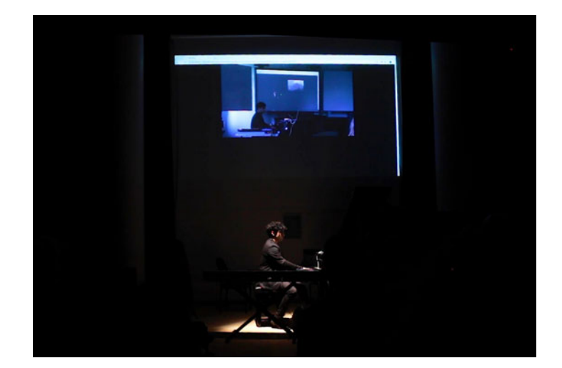
Figure 5: Nested videos in the HCMF performance on 17 November 2018 (with the performance films from Darmstadt and Esslingen onscreen).