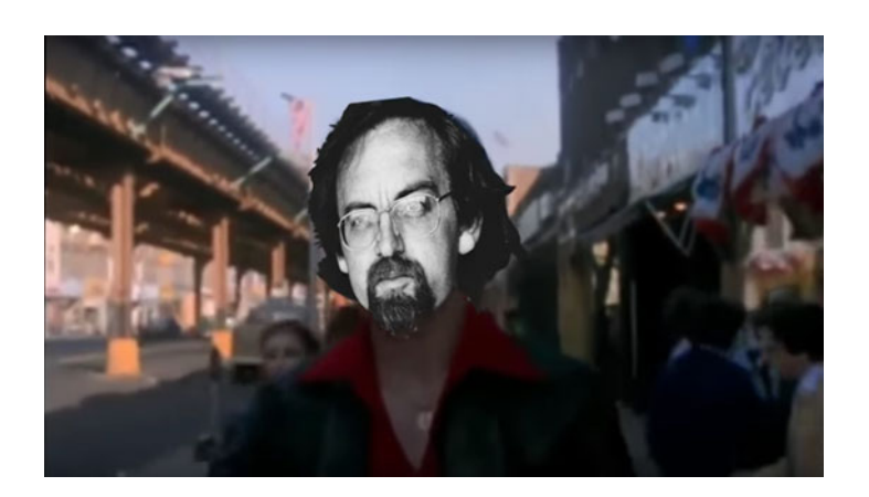
Figure 4: Screenshot of 'Ferneyhough Disco Bonanza' uploaded to WIKI-PIANO. NET (archive version 17 November 2018).