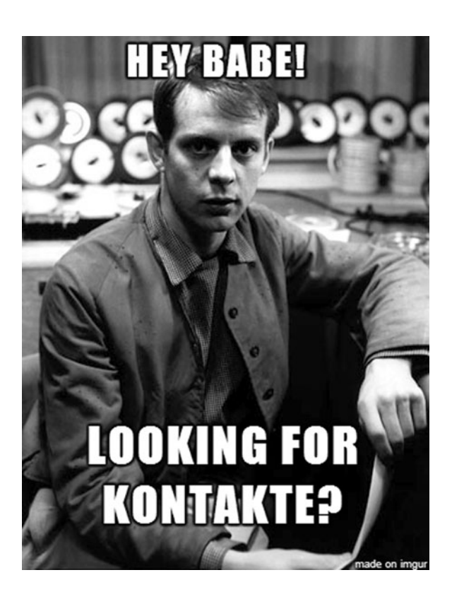
Figure 7: Image posted to WIKI-PIANO.NET (archive version 9 May 2018)

through the ironizing of both'.<sup>17</sup> There was also a sophisticated crossing of the cultural divide by some users, such as the 'Ferneyhough Disco Bonanza' mix, or the meme shown in Figure 7, which requires a knowledge of Stockhausen's oeuvre to understand the pun.