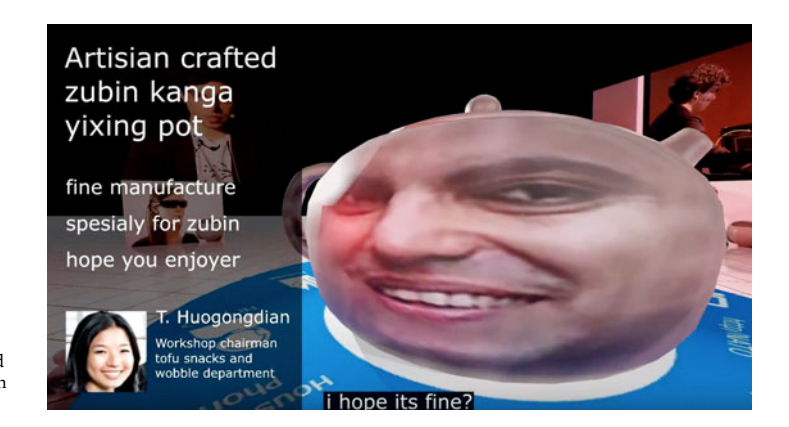
Figure 6: Excerpt from reaction video, posted to WIKI-PIANO.NET (archive version 13 April 2019).

Principal Skinner serves his superintendent hamburgers rather than steamed clams (calling these hamburgers, 'steamed hams'). The meme often refers to deliberate deception and disingenuous contributions on the internet and in this case the user's actions could be interpreted as a direct criticism of the work, or could be seen as a form of 'shitposting' (aggressively filling a forum with off-topic content, a common use of this meme). <sup>14</sup> Although the change to the website was dramatic it was overwritten within 24 hours, as Schubert immediately predicted: 'wow – yes, the site seems to be taken by one user pretty badly . . . I think we'll need to get some other people to edit it: '.' This rare occurrence can be seen as a legitimate, extreme use of the website, but it raises questions about the ethical implications of leaving a site open to a single user who, with enough patience, can wipe over many weeks of content created by other users.